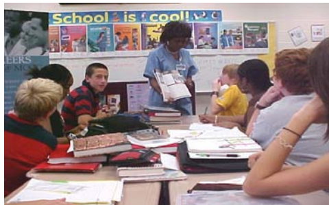
Huntington Middle School